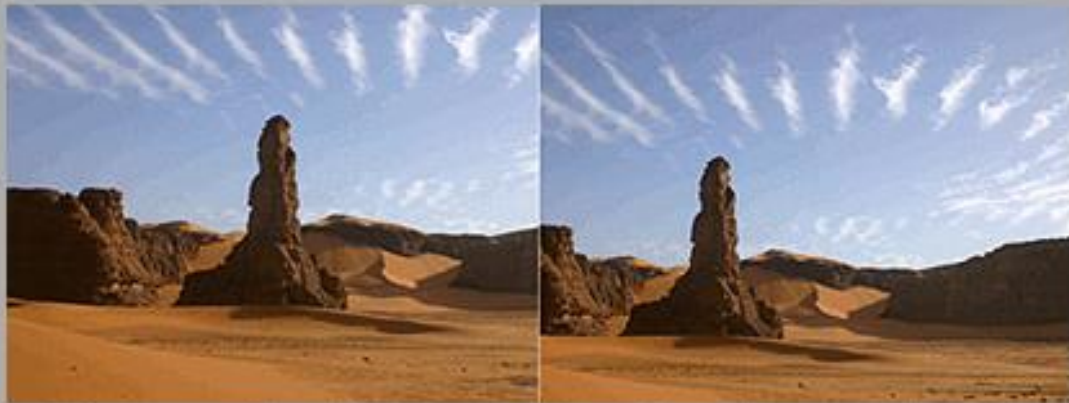
Left: Center composition. Right: Rule of Thirds used.